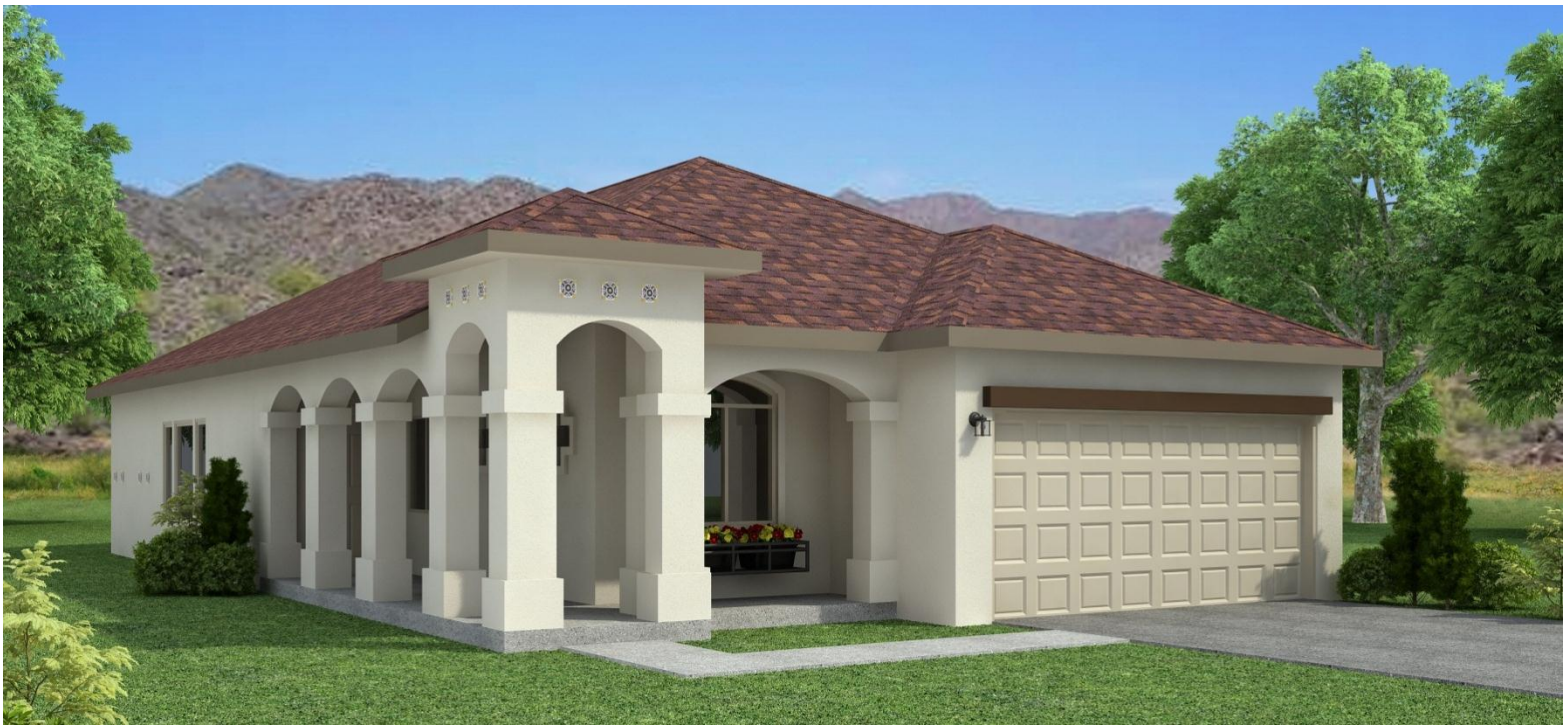
FRONT ELEVATION ©