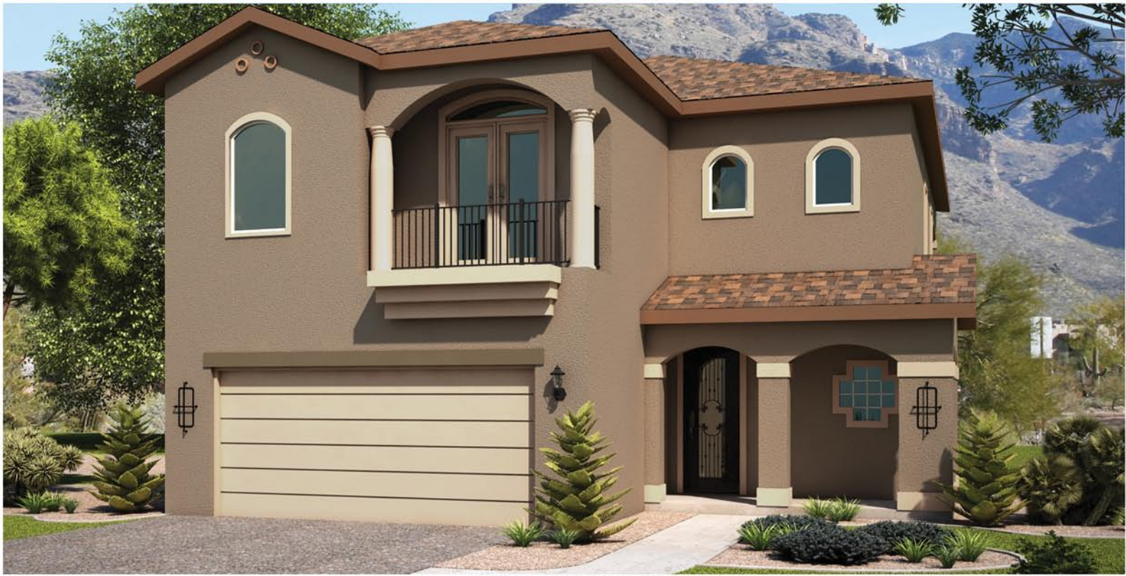
FRONT ELEVATION ©