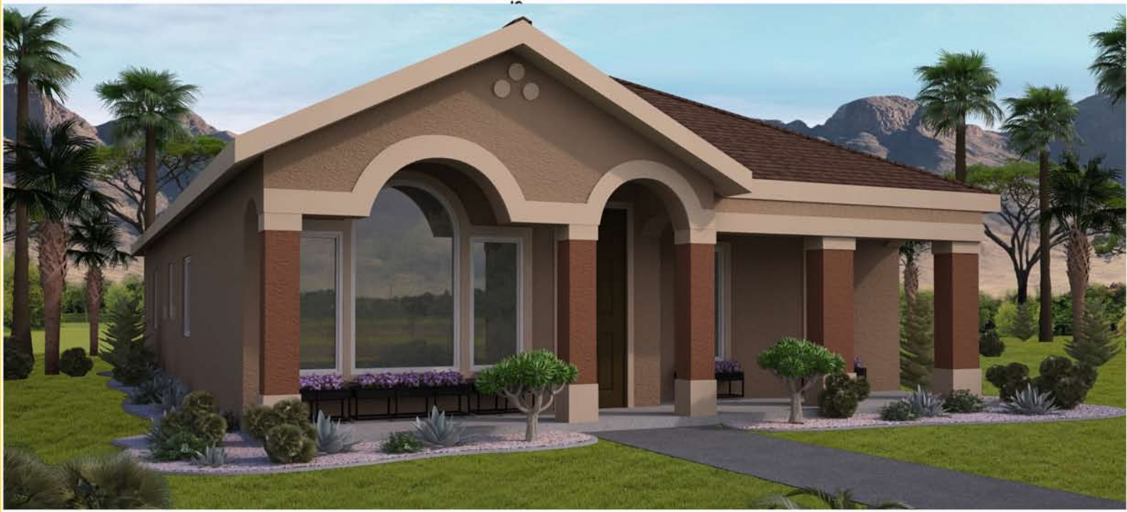
FRONT ELEVATION ©